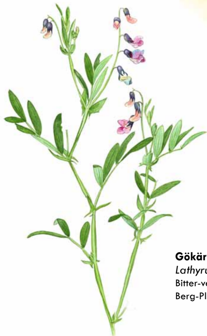
Gökärt Lathyrus linifolius Bitter-vetch Berg-Platterbse